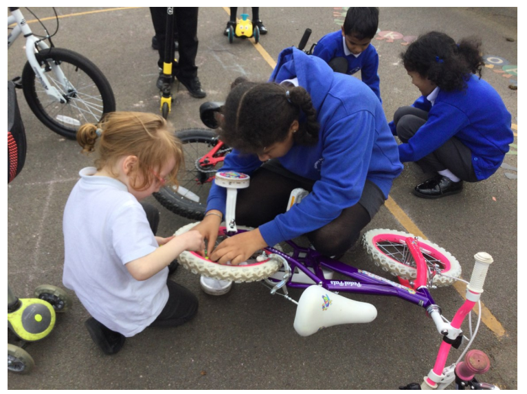
Junior Road Safety Officers supporting Bling Your Bike Day