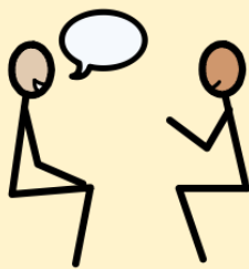
M aking conversation

Drawing Club is an approach designed by Greg Bottrill that immerses children into a world full of imagination and opens up the magic of tales and stories whilst at the same time enriching their language skills and developing their fine motor. Drawing Club is a fantastic place to start a child's experience of school 'Literacy'. Drawing Club is based upon the 3M principle. These are: