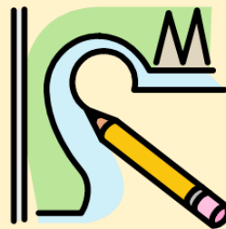
M ark making